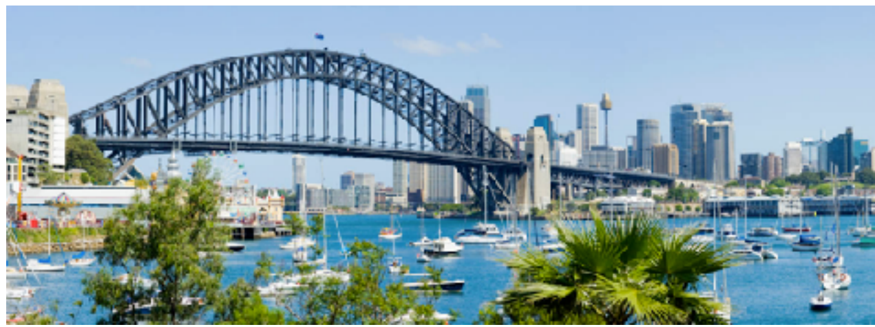
Sydney Harbor Site Seeing Cruise Darling Harbour is a short walk from your hotel