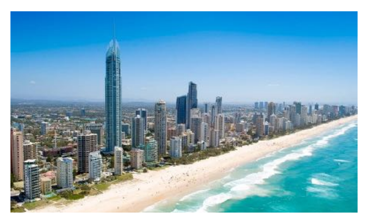
Surfers Paradise Beach