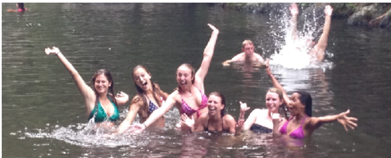
University of South Carolina 2018 class at Crystal Cascades