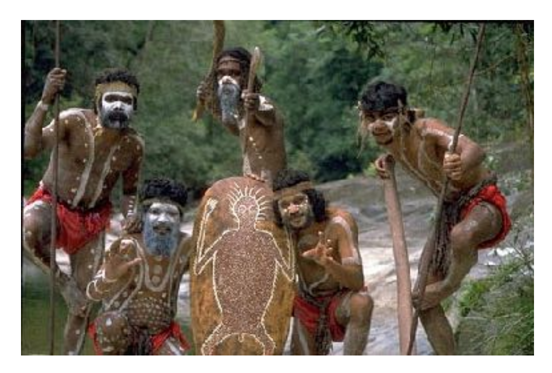
Indigenous Australian's are the Oldest Surviving People on the Planet

Second World War, 6.5 million migrants from 200 nations brought immense new diversity to a young country that was largely a white Anglo-Saxon society prior to the war.