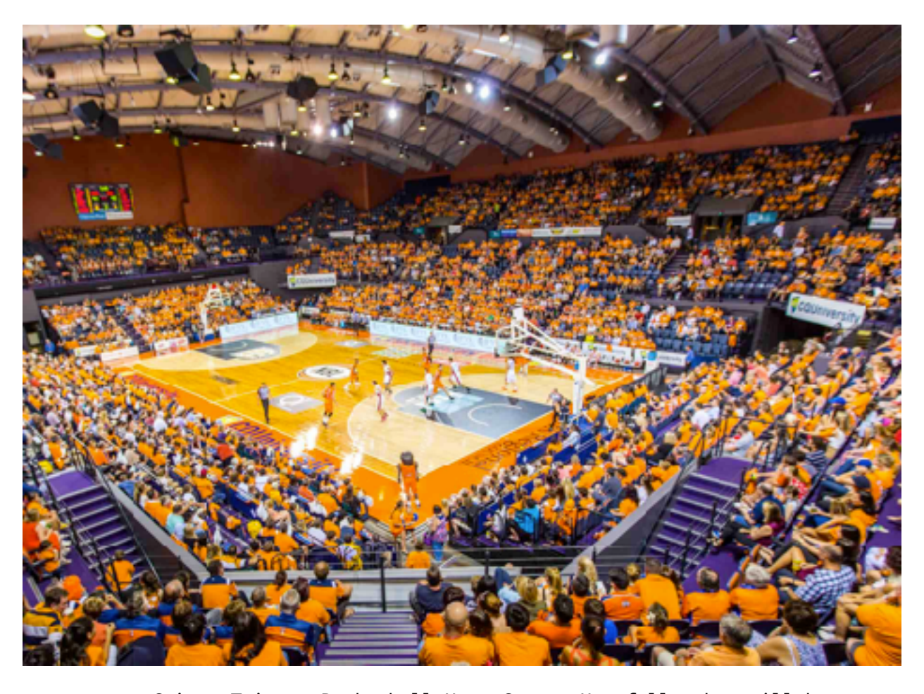
Cairns Taipans Basketball Home Game - Hopefully they will have a home game whilst we are in town?

Happy New Years Eve! - There will be fireworks on the Cairns Esplanade at 9:30pm as well as many outdoor bands