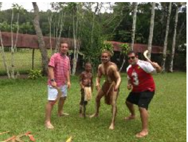
Students with Pamagirri Tribesman learning Indigenous Culture