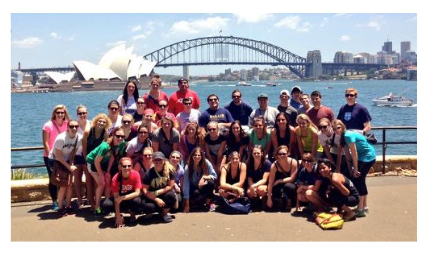
Welcome to Australia!

- Several stops including Mrs Macquarie's Chair with terrific views of the city