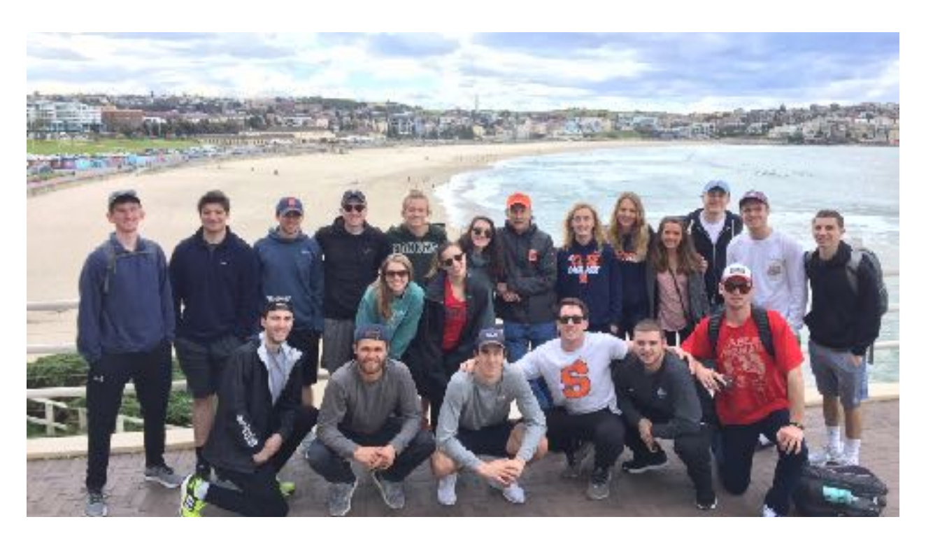
SU 2017 Class at Sydney's famous Bondi Beach

We hope you enjoyed your program DownUnder! At Sports Travel Academy the World is Your Classroom!