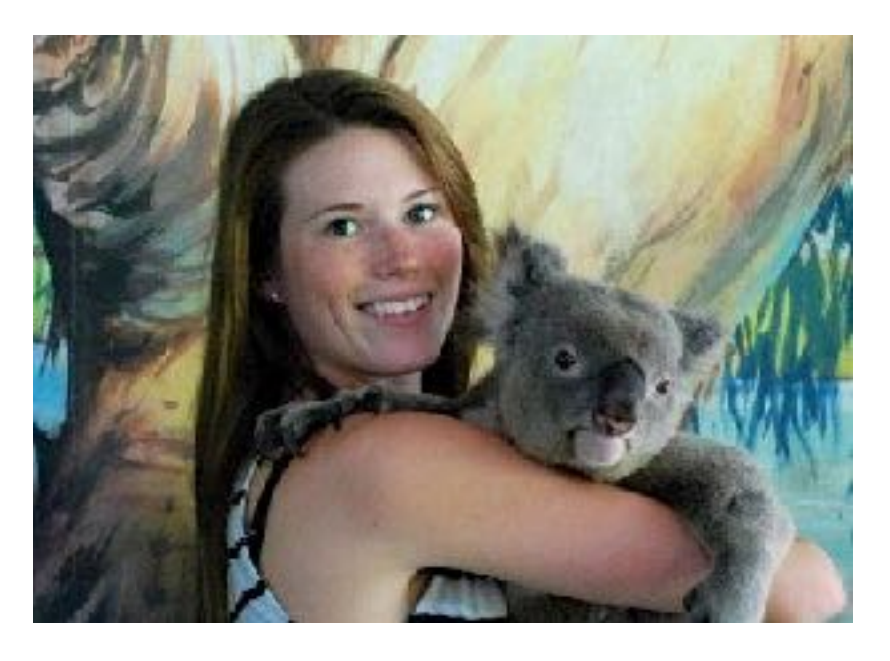
Cuddle a Koala at Currumbin Wildlife Sanctuary

4:30pm: Depart for hotel, arrive around 5:00pm