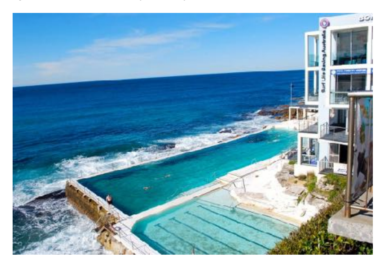
Bondi Icebergs Swim Club